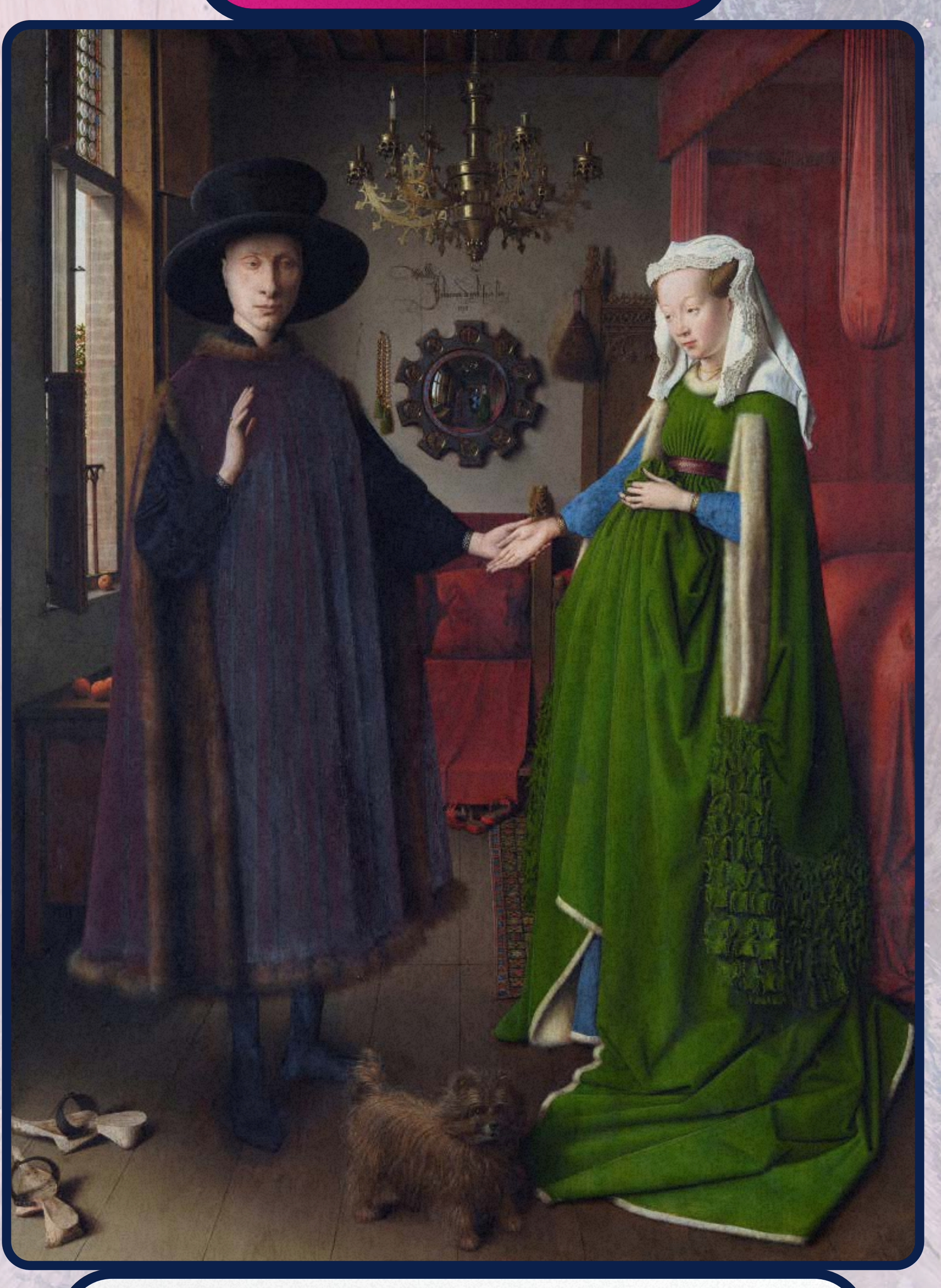
The Arnolfini Portrait (1434)