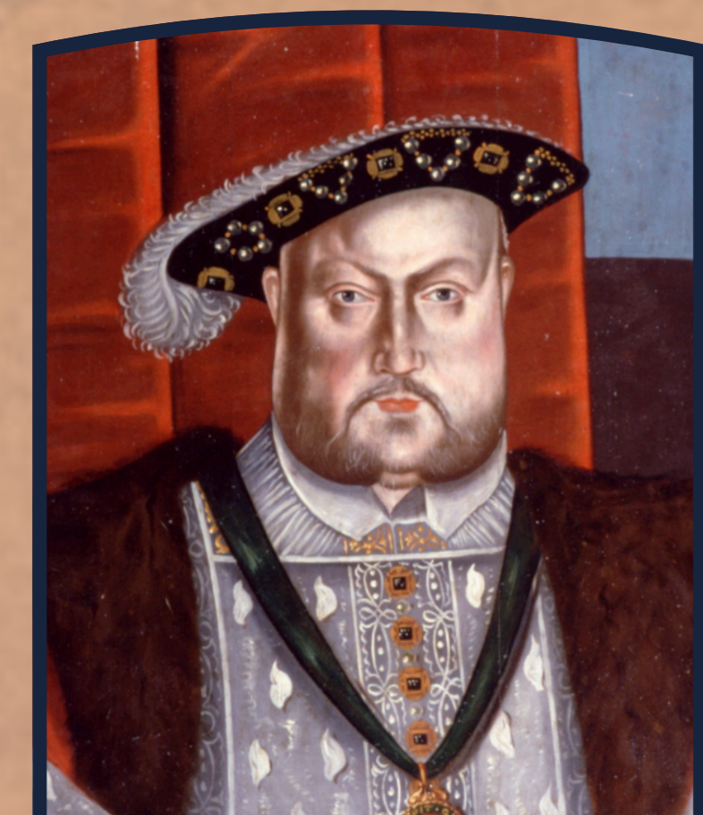
Henry VIII (1509-1547)