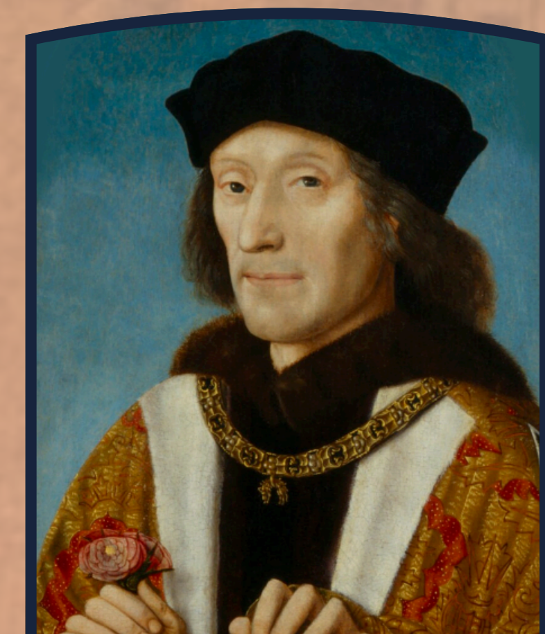
Henry VII (1485-1509)