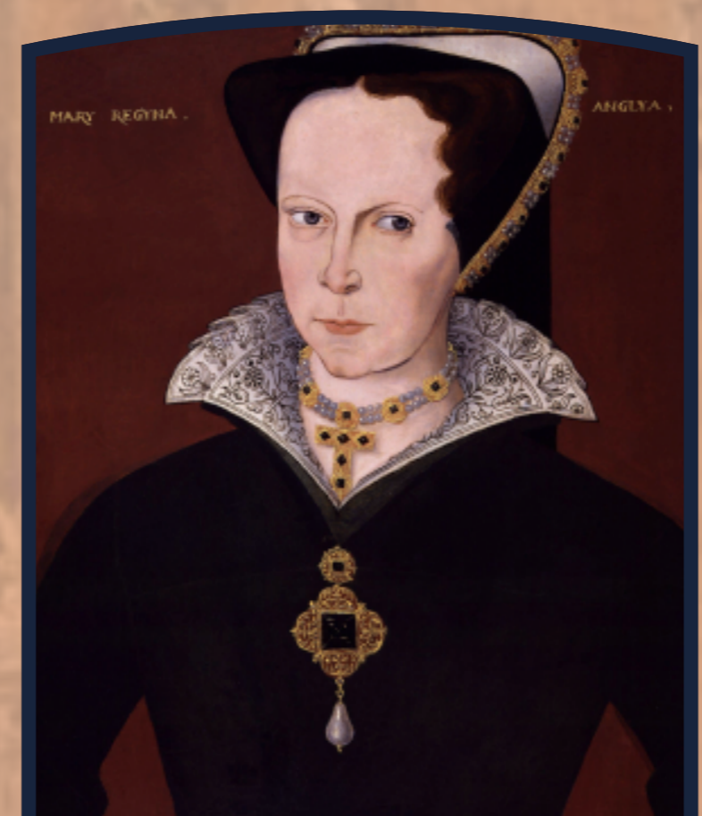
Mary I (1553-1558)