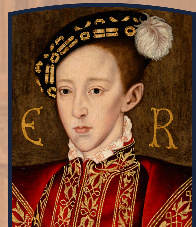
Edward VI (1547-1553)