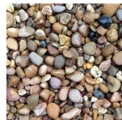
Gravel or pebbles

We fully appreciate that the current financial climate is tight for everyone so any help, even if it's just directing us to a local business that we could purchase from, would be appreciated.