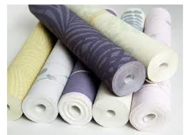
Old rolls of wallpaper / paper