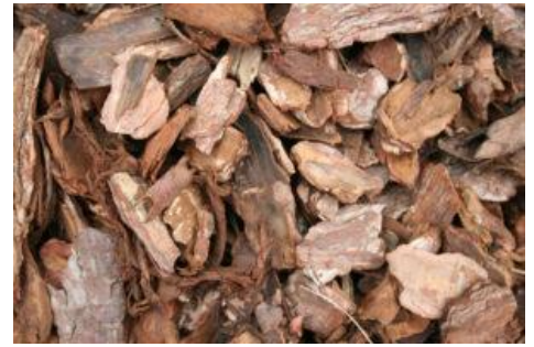
Play bark chippings