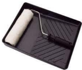
DIY paint rollers and trays

Despite our visitors last weekend, we are still forging ahead with our plan to improve our Reception outdoor area. We have lots of ideas and we need you! There are a few things that we are on the hunt for which if you have and are happy to donate, we would love to hear from you.