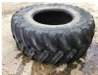
Tractor / lorry tyre