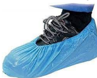
Blue disposable shoe covers (We know that's random!)