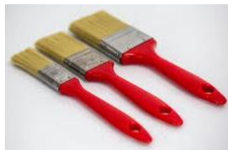
DIY paint brushes