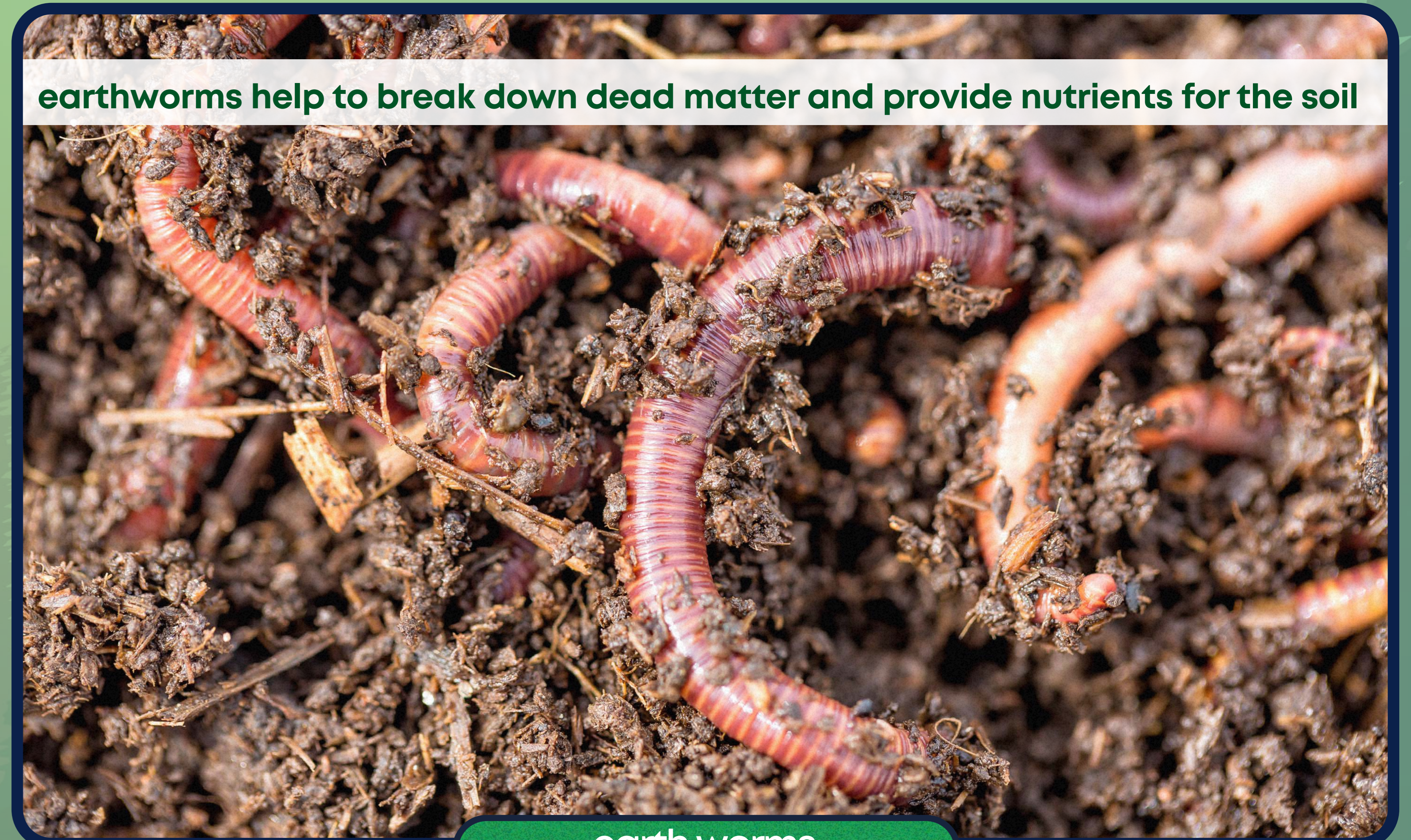
earthworms help to break down dead matter and provide nutrients for the soil