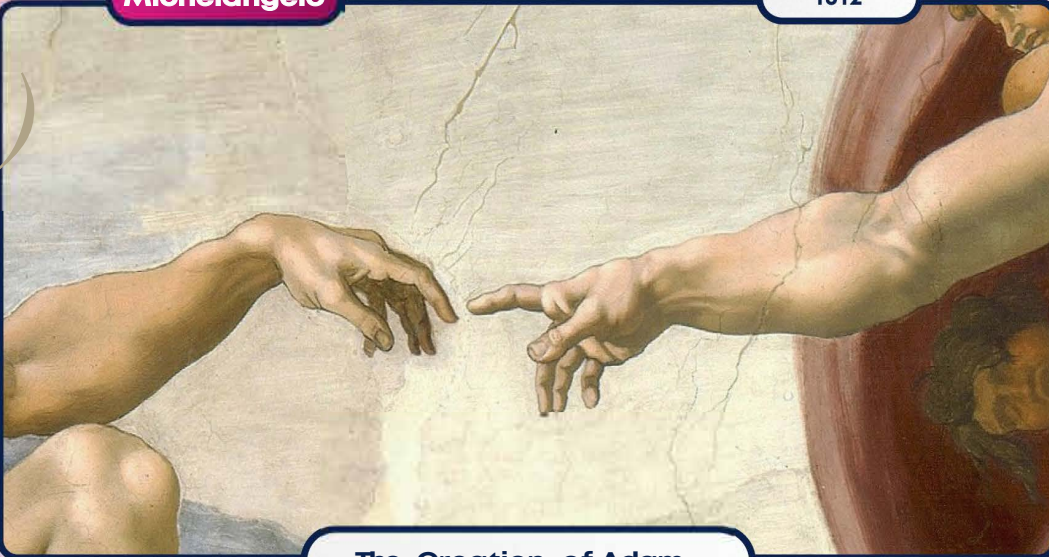
The Creation of Adam